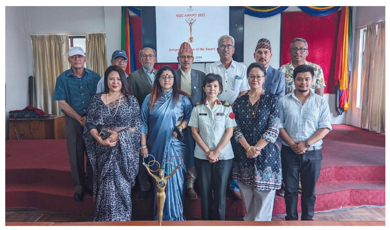
Final Day of Judging Session of NOC Award 2023