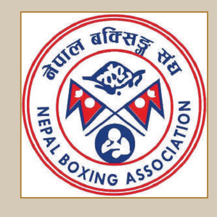
NOC Best Association Nepal Boxing Association